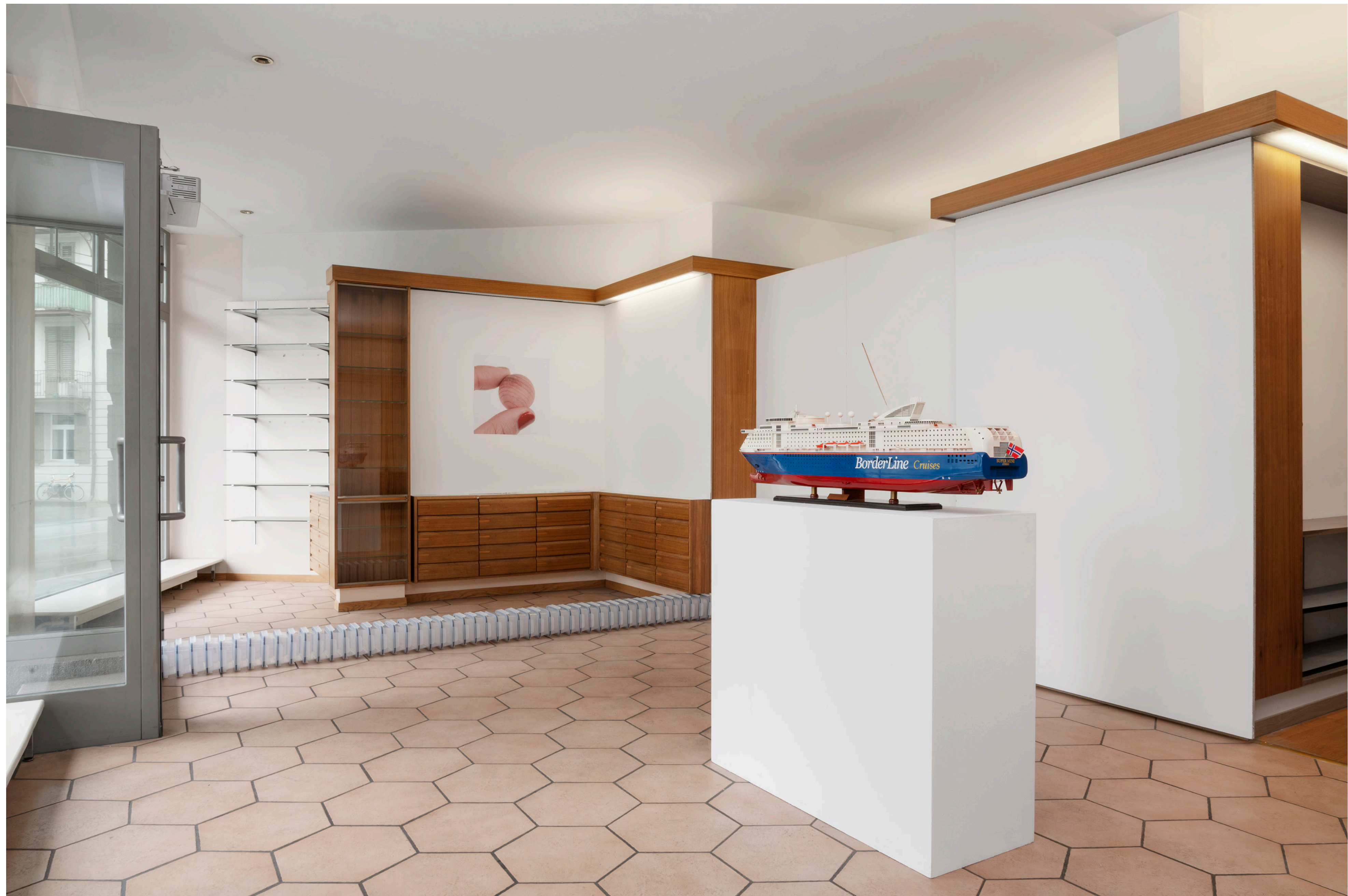
Ectoplasmic Launch: Dreamerbulk Cycle